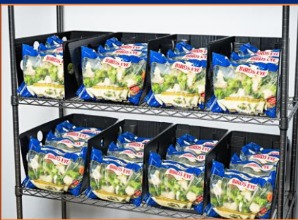
Shelf bins & trays

The three primary plastic corrugated product lines are: