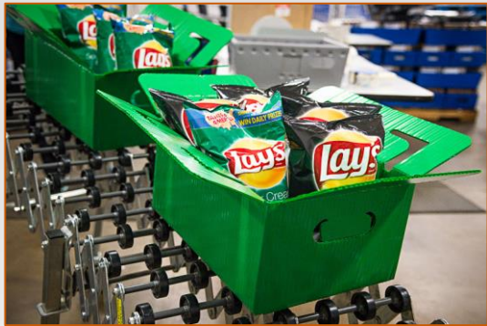
Plastic corrugated boxes