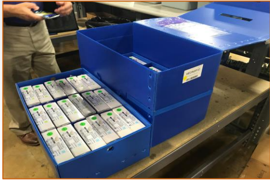
Custom Transport System