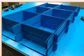
Plastic Partition Sets