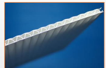
Plastic corrugated - PE