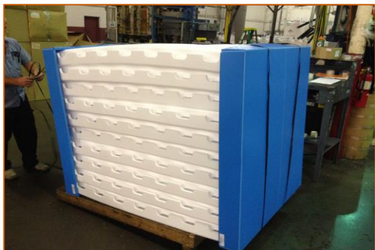
Returnable plastic end caps