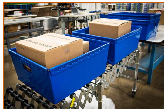
Conveyor totes protect packages