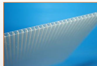
Plastic corrugated - PP