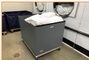
Collapsible Utility Cart