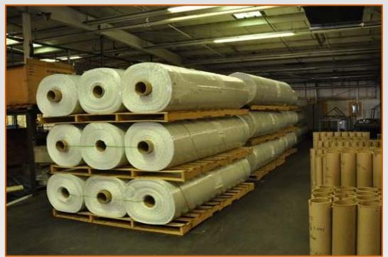
Master rolls of plastic ready to be cut to size

For more information scan the QR code with your phone camera or visit <a href="www.l-si.com">www.l-si.com</a>