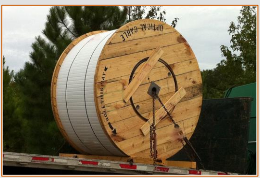
Protective Reel Wrap