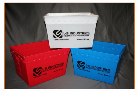
Plastic Corrugated Totes