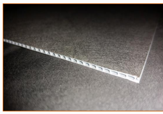
Evolon Fabric laminated to plastic corrugated