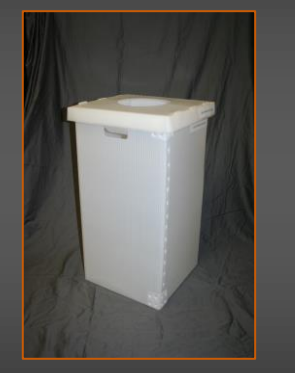
1529 Bin (29 Gal)

Corrugated plastic recycle bins are more durable than temporary paper bins and less expensive than more permanent structures. It's the perfect material for a lightweight, portable recycle bin.